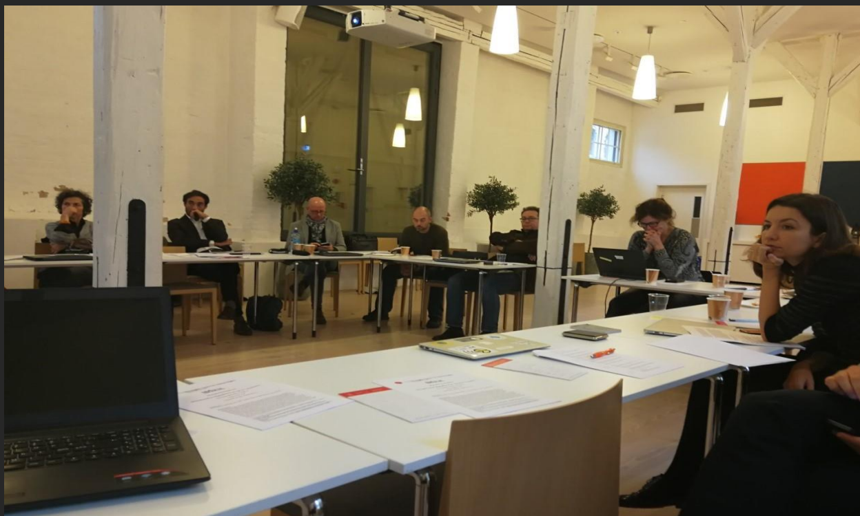
Beyond Encampment: Managing Mass Migration in an Age of Urbanization – University of Oslo – 2 November 2018 Human Rights Research League – www.hrrleague.org

The many ensuing discussions, conducted under Chatham House rules, focused in particular on the following cross-cutting topics: Curbing global migration flows versus preservation of individual rights to protection; local integration versus co-habitation; the psychology of exile and identity dissolution; and the challenges and opportunities of employing information technology in communicating with target groups.